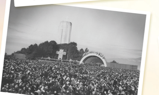
Band Shell and Community Choir, 1947