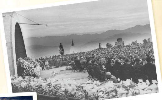
View from the Stage, 1948