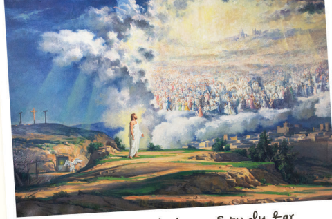
Allyn Cox, Preliminary Study for The Resurrection, c. 1961, oil on canvas

You can see the final painting during the Hall of Crucifixion-Resurrection Video Presentation